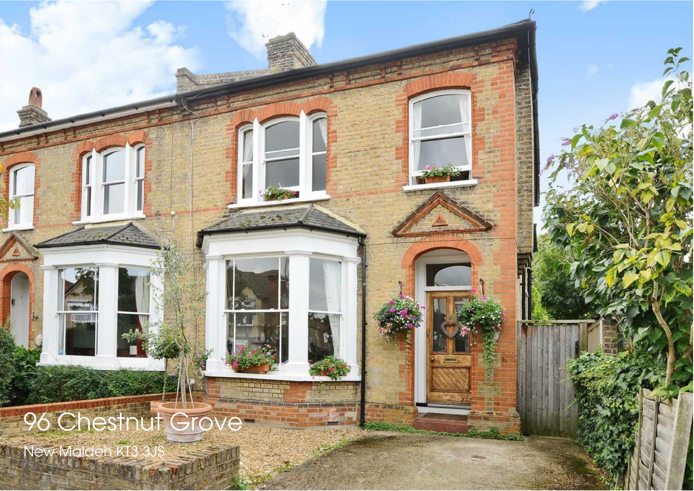
96 Chestnut Grove New Malden KT3 3JS